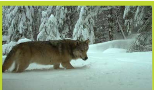
IMAGE: The Indigo group, a newly named wolf troop first confirmed in February 2019, has taken up residence in an area within Douglas and Lane Counties (photos by USFWS remote camera).

Wolves are protected under the federal Endangered Species Act (ESA) in the western two-thirds of the state, but the Trump administration, specifically the U.S. Fish and Wildlife Service, is