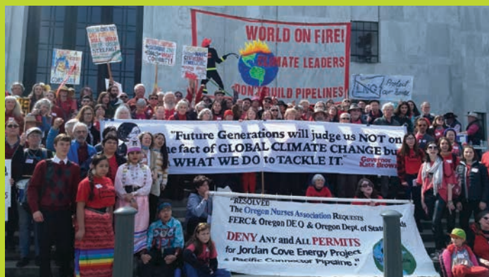
IMAGE: Lobby day in Salem against the Jordan Cove LNG, a fracked gas pipeline scheme.

Projects this horrific don't come around every day. This is a fight for our future, and Cascadians are rising together to fight it.