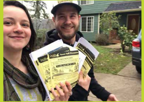
IMAGE: WildCATs canvass the Thurston Hills neighborhood (photo by WildCAT).

Decades of science-backed studies have informed us that clearcuts make fire hazard worse. In fact, forests that have been degraded by decades of clearcut logging actually burn more severely