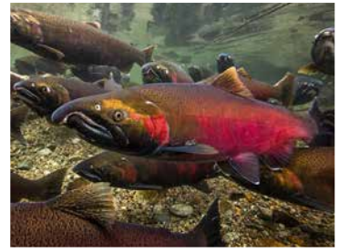
IMAGE: Coho salmon, also known as silver salmon, returning to fresh water to spawn (courtesy of Jessica Newley/Smithsonian Magazine).