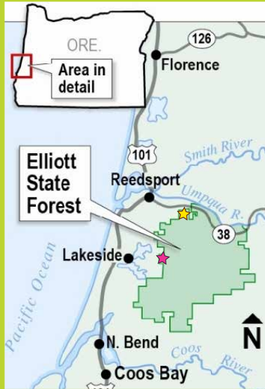
IMAGE: Map showing the location of the Elliott State Forest. Superimposed stars show where East Hakki Ridge and Benson Ridge parcels are.

On the legal front, we are continuing to contest the disposal of two parcels of the Elliott State Forest that the State Land Board sold in 2014. Our challenge of the privatization of the 788-acre East Hakki Ridge parcel sold to Seneca Jones Timber Company will be argued in front of the Oregon Supreme Court on June 4. Our case against Scott Timber's purchase of the 355-acre Benson tract was argued in federal district court in Eugene in May. Central to both cases are threatened mature forests and imperiled species that reside in them.